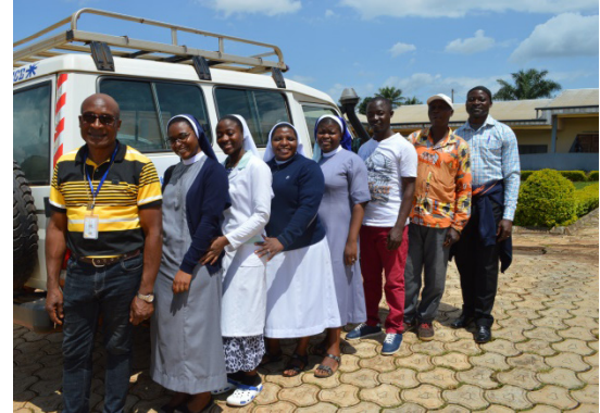
Mobile Cardiac Team Members

tients attended to in Ndop expressed feelings of satisfaction after consulting and receiving medications. “I am very happy receiving my treatment in Ndop as I have spent very little as transport from Baba to Ndop compared to my past trips to the Cardiac Center Shisong. I wish that the cardiologist should continue to come and meet us in Ndop” were the expressions of one of the patients after consultations. At the end of the outreach consultations, some potential for numerical growth in patient turnout were identified